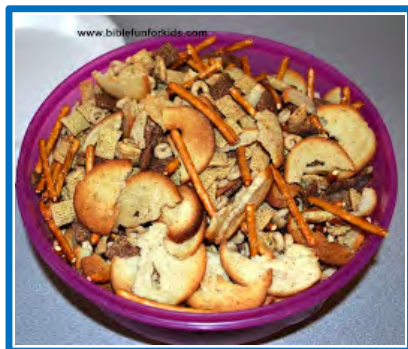
Love this snack idea! Make chex mix look like pig food!!!

https://lettheirlightshine.com/category/prodigal-son/