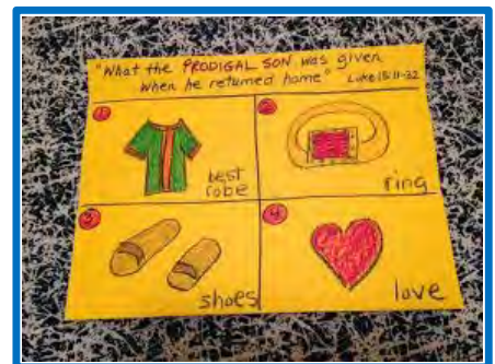
What a great idea! Draw a picture of all the things the son was given when he returned home!!!

http://bibleschoolteachers.blogspot.com/2011/01/pig-food.html