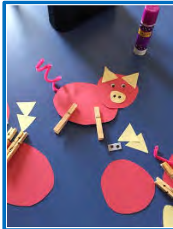
Easy and adorable pig with clothespin legs!

https://www.pinterest.com/pin/34762228347335802/