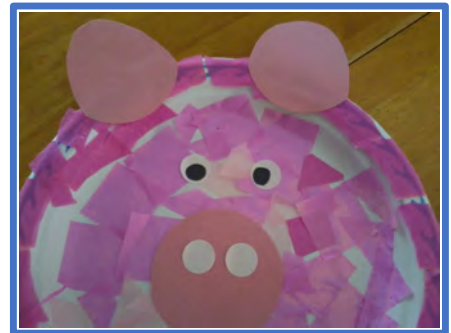
Love this cute paper plate pig! You could just use markers if you don't have tissue paper!

https://www.facebook.com/231270687078248/post/s/ready-for-a-prodigal-son-messy-church-this-afternoon-at-3pm/819874491551195/