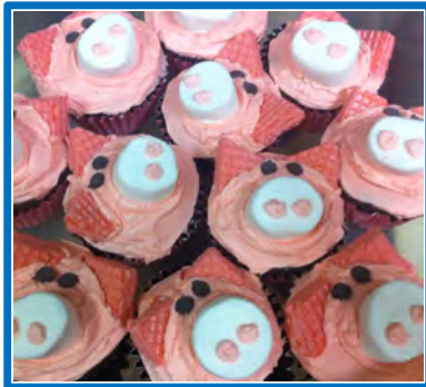
Yummy pig cupcakes with marshmallow noses!

https://www.pinterest.com/pin/34762228347335802/