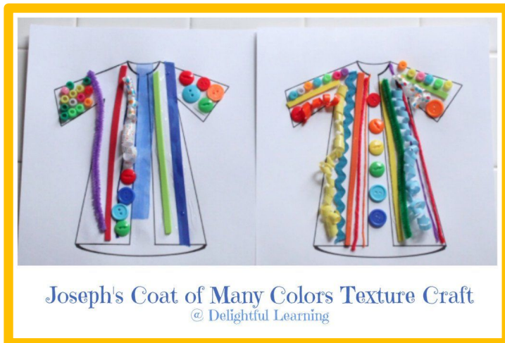
Joseph's Coat of Many Colors Texture Craft © Delightful Learning

https://nl.pinterest.com/eisn/bible-based/